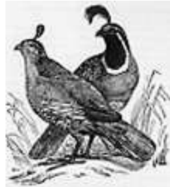
High Desert Chapter