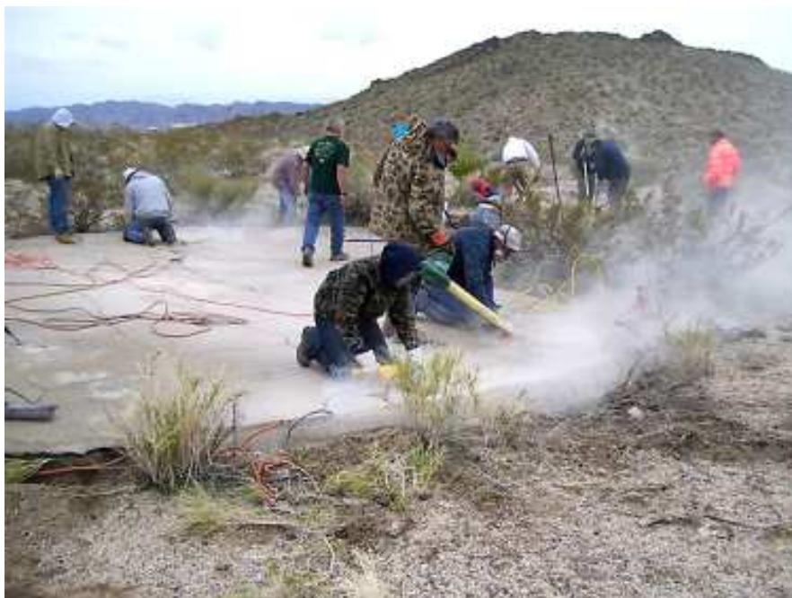
With a huge crew of 64, the work on these guzzlers went well despite uncertain weather. Here a crew cleans and prepares the surface of a guzzler for a new patch job and a fresh coat of Merlex.

salsa, twenty pounds of beautiful hydroponic tomatoes (thank you Tommie Park), two very large cans of peaches and pears, two gallons of orange juice, two gallons of apple juice and two gallons of milk; and that was just for breakfast. For dinner we went through five Dutch ovens full of elk stew which consisted of five roasts, five pounds of onions, ten pounds of potatoes, and two #10 cans of green beans, four loaves of bread along with corn bread on Saturday night and on Friday night we had thirty pounds of Jesse's barbecued fish wrapped in six pounds of bacon and marinated in Italian dressing, four trout, along eight pounds of broccoli and coleslaw. Bob Burke provided a great