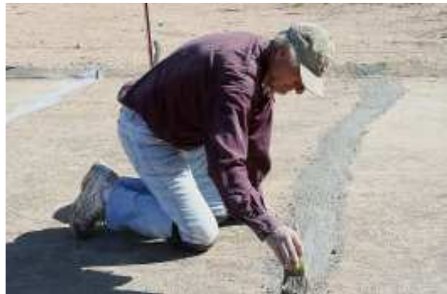
Below— Our hardy weekend work crew brooms Merlex waterproof stucco on finished rain apron on A16. This prevents rain water soaking into the concrete. All the rain that lands on the apron goes into the underground water tank.