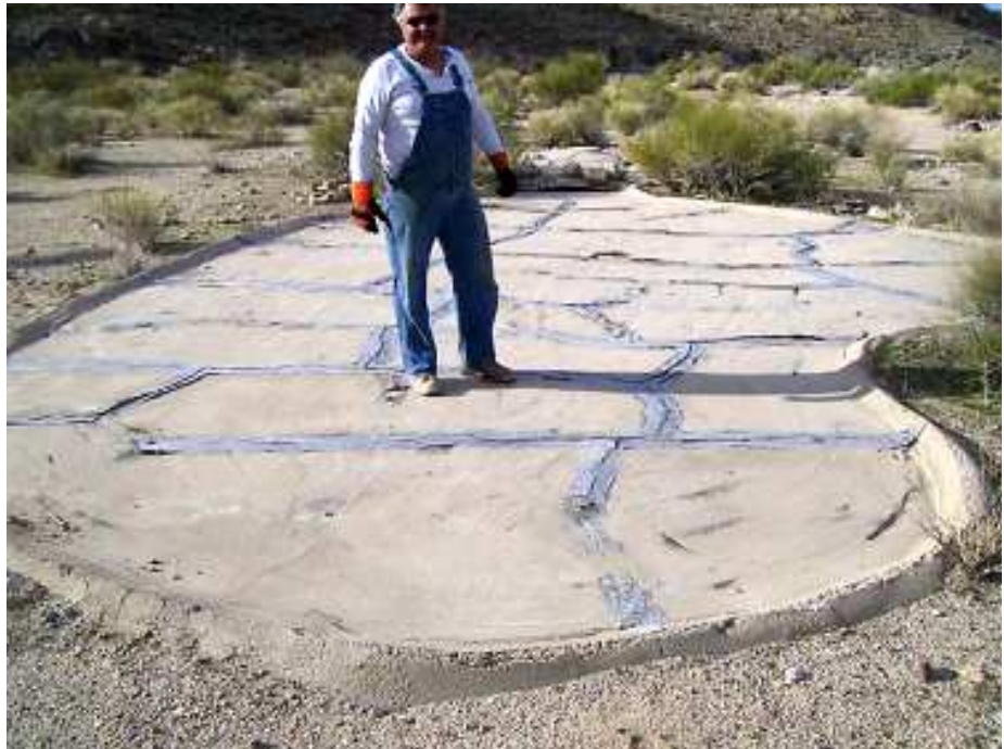
The old surface on this guzzler is typical. Cracked concrete has been patched with asphalt. All this must be removed and replaced. Then the finish coat of Merlex can be brushed on and tinted.

the cooks for preparing the food (Judy, Jenette, Kippy, Jesse, Debra, Lyle) and Christina and Shirley for policing the camp area and filling up